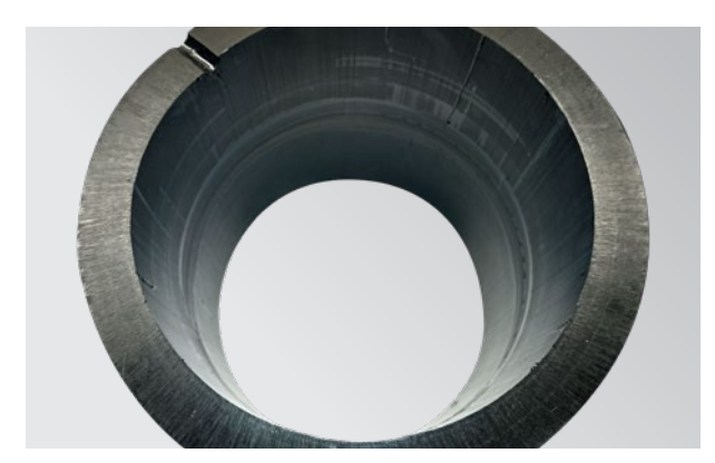
Typical debeaded pipe surface using the ClearBore tool.