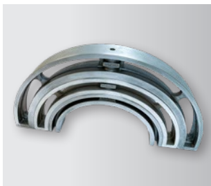
Full range of liners including barrier pipes and bespoke sizes