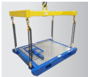
Skid frame platform and lifting beam