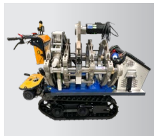
Battery powered Tracked Vehicle