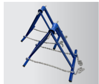
Adjustable pipe rollers