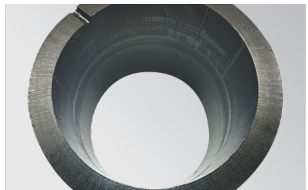
Typical debeaded pipe surface using the ClearBore tool.