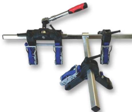
Titan 200 being used with T-Adapter and V-Block