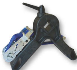
34989 / 12799