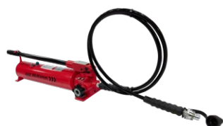
13926 Hand pump assembly