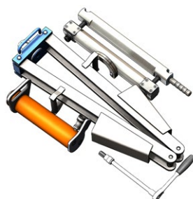
SQT250A-2 Basic squeeze tool kit without pump or stops

Note: other stop sizes available on request.