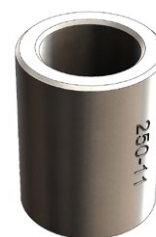
35885/DIA-SDR End stop (2 required per beam set)