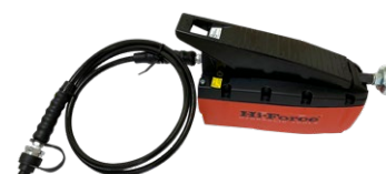
13927 Air intensifier assembly